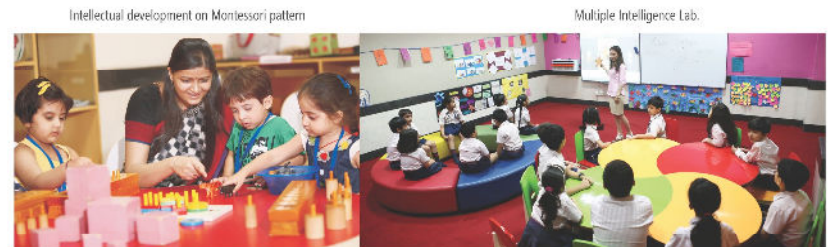
Intellectual development on Montessori pattern