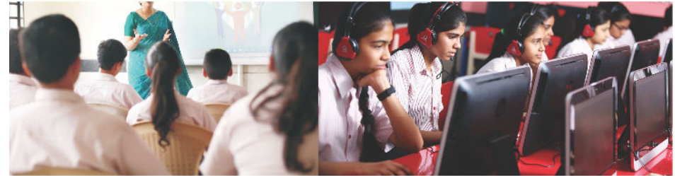
Interactive white board and projection screens

& certainly dream ... to be an ACHIEVER !!